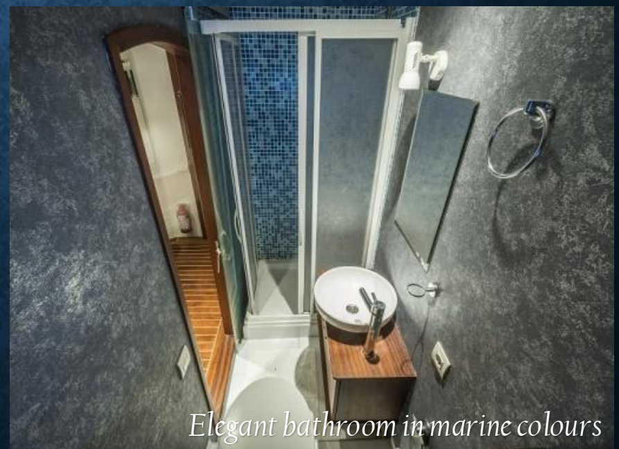
Elegant bathroom in marine colours