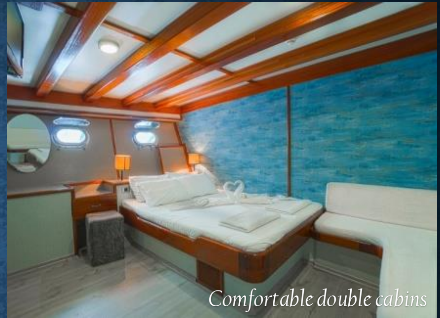
Comfortable double cabins