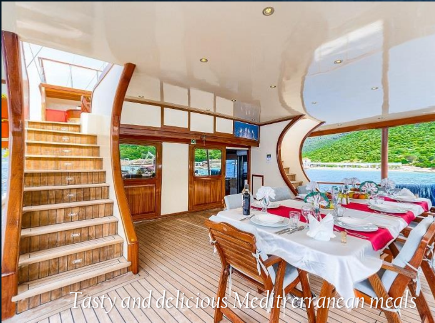
Tasty and delicious Mediterranean meals