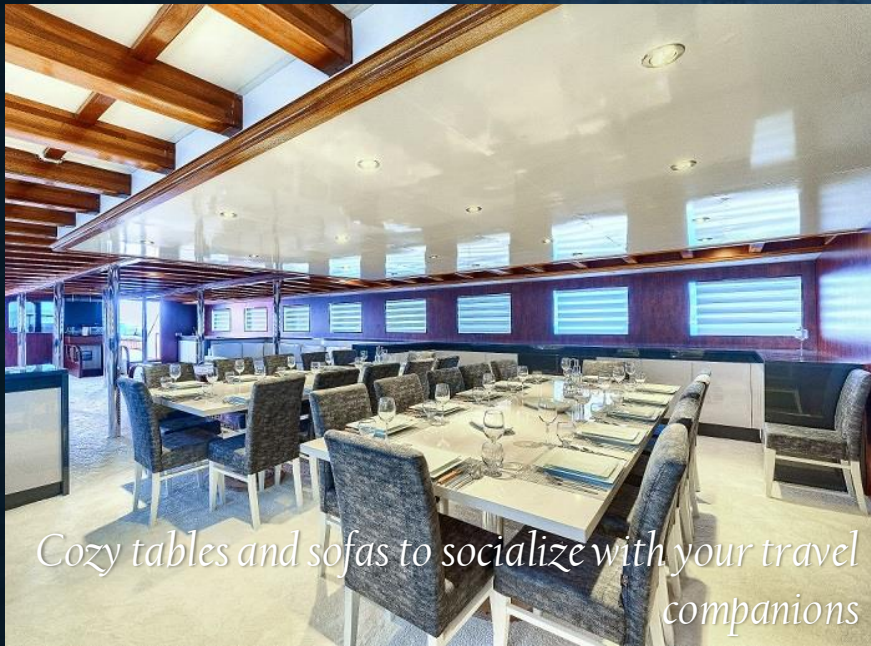
Cozy tables and sofas to socialize with your travel companions