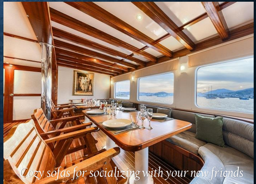
Cozy sofas for socializing with your new friends