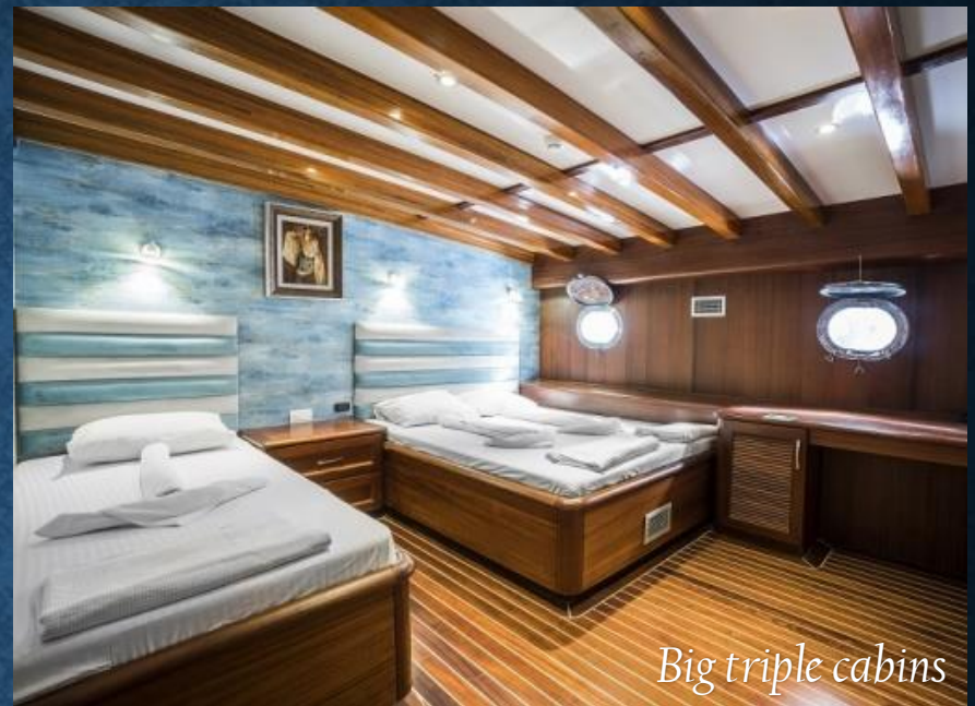
Big triple cabins