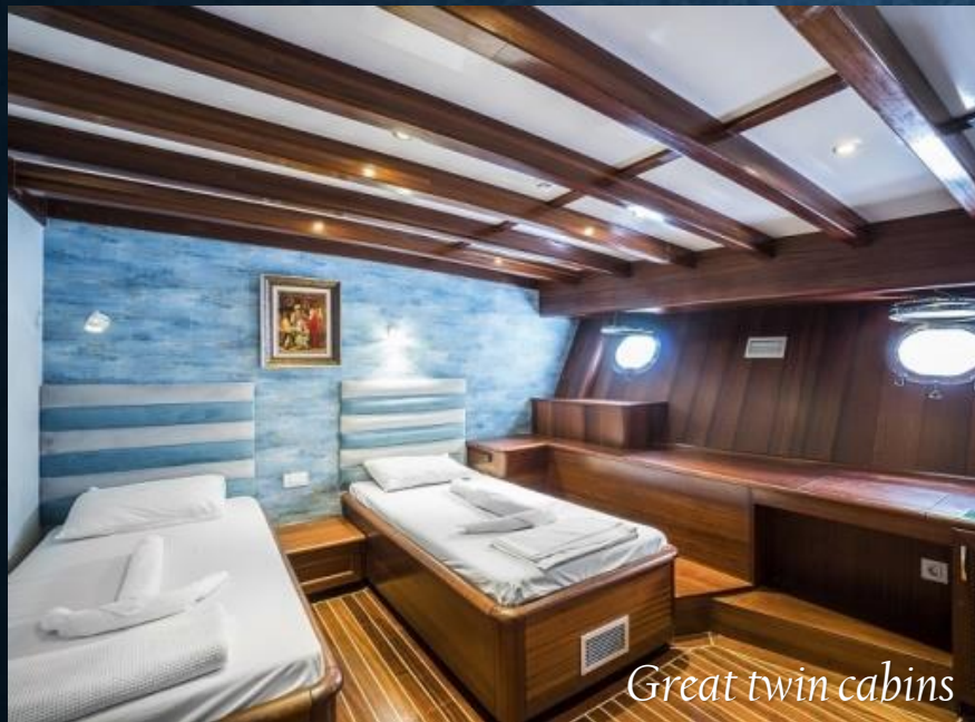
Great twin cabins