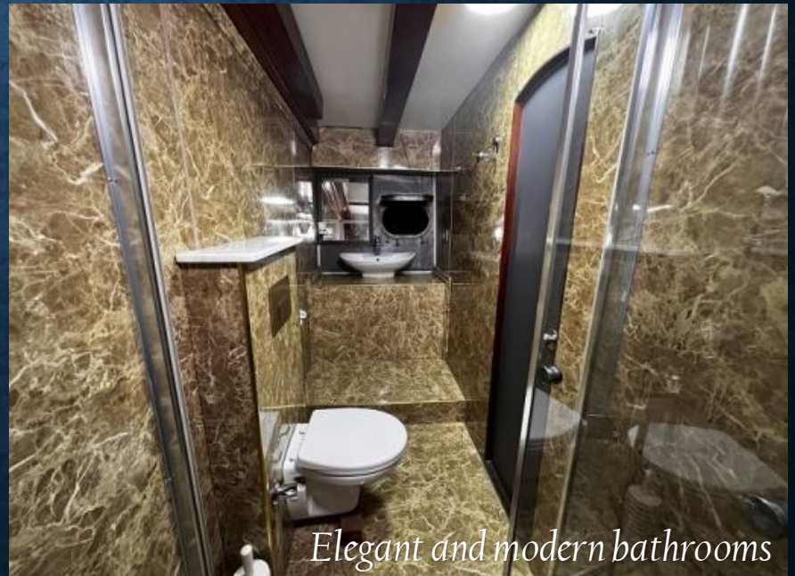
Elegant and modern bathrooms