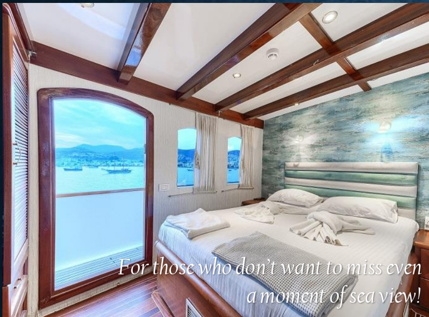
For those who don't want to miss even a moment of sea view!