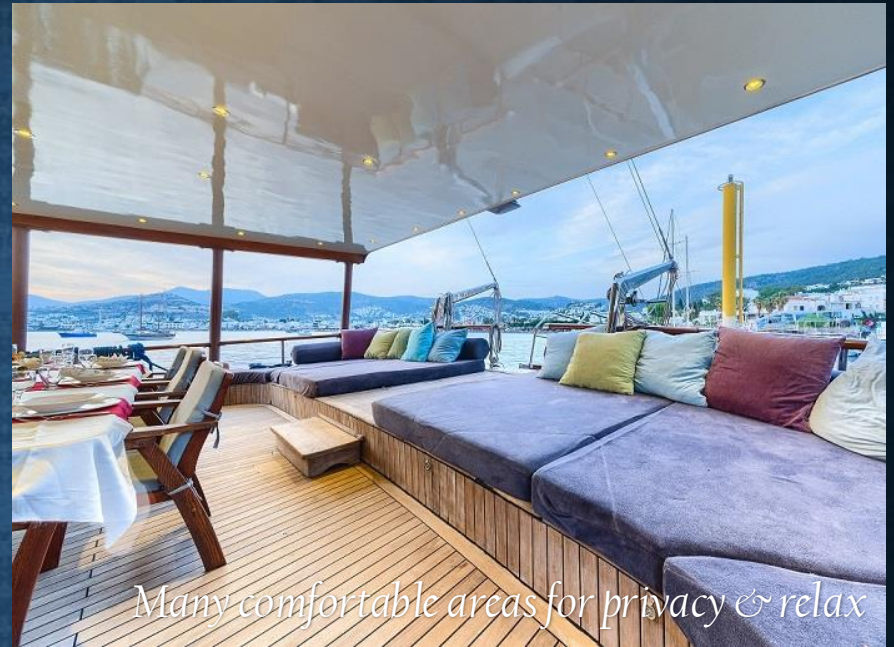
Many comfortable areas for privacy & relax