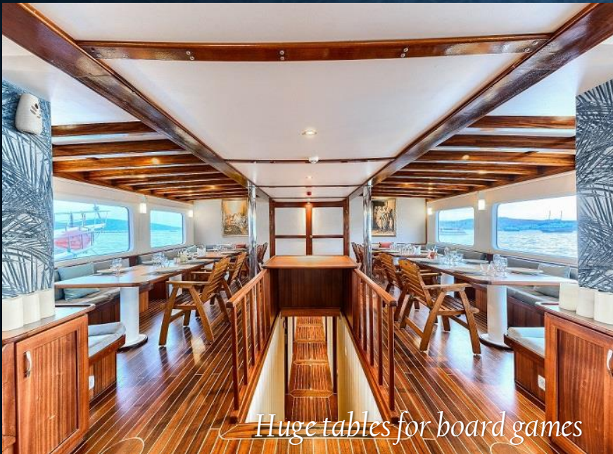
Huge tables for board games