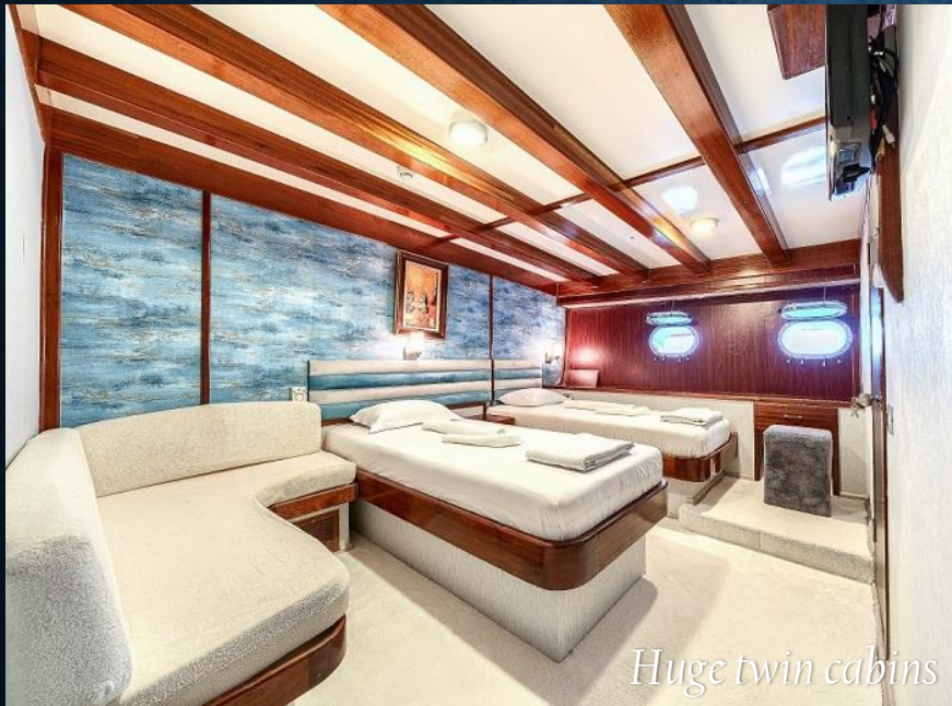
Huge twin cabins